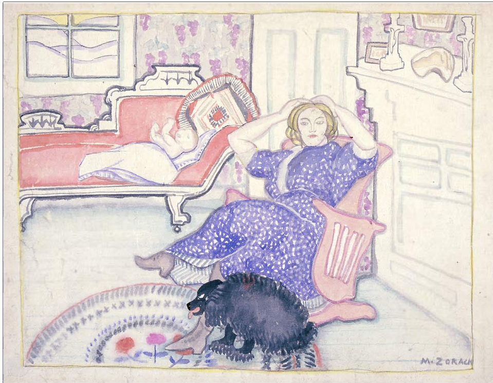
Marguerite Thompson Zorach (1887-1968), Leisure , 1915, watercolor on paper mounted to board, 12 1/2" x 16 3/4" , signed

One of the first artists in the United States to employ the sculptural technique of direct carving, William Zorach was born Zorach Samovich in Eurberick (now Jurbarkas), Lithuania in 1889. When he was a child, his family emigrated to the United States, settling in 1891 in Cleveland and changing the family name to Finkelstein. In grammar school, Zorach's name underwent a second transformation when his teacher dubbed him William. Zorach's parents struggled to feed their ten children, and when he was a teenager, Zorach dropped out of school to work for a commercial lithography firm, while taking night classes at the Cleveland Art School. In 1908, Zorach left Cleveland for New York City and enrolled in courses at the National Academy of Design. Two years later, he traveled to Paris, where he studied at the cutting-edge Académie de la Palette with John Duncan Fergusson and Jacques-Emile Blanche and met Marguerite Thompson, an American artist who had been in Paris since 1908. In 1911, Zorach participated in the Salon d'Automne, and the following year, the couple moved back to the United States.