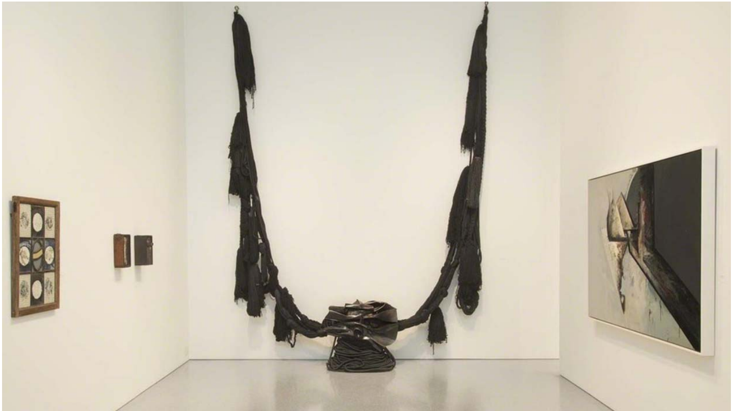
The Time Is N♀w, Exhibition view.

Michael Rosenfeld Gallery proudly presents The Time Is N♀w , a group exhibition featuring thirty-two artists whose work the gallery has consistently championed for three decades through thematic group exhibitions as well as multiple solo shows.