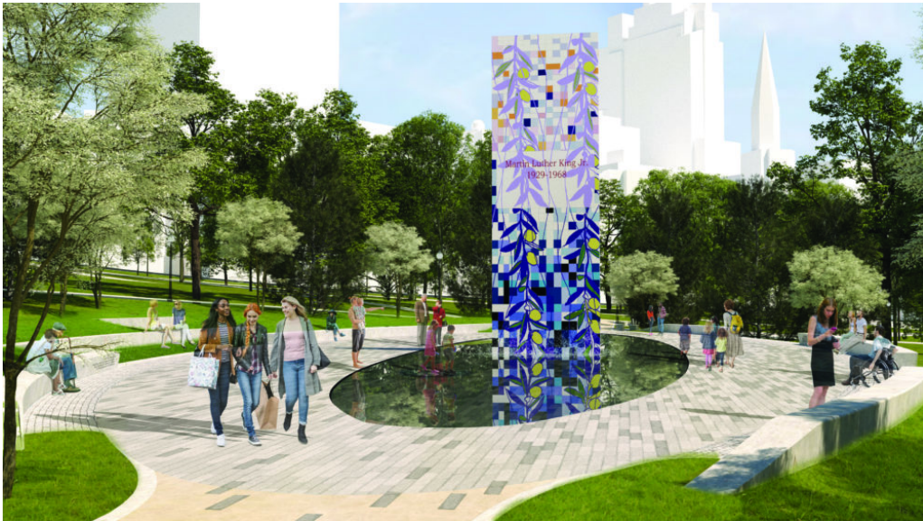
Yinka Shonibare's proposed memorial

Yinka Shonibare's proposal examines race and class through painting, sculpture, photography and film, often questioning cultural and national definitions. He proposes a memorial walkway, sculpture and water feature. The walkway would be lined with a series of 22 inscribed benches where people can sit and learn about the Kings.