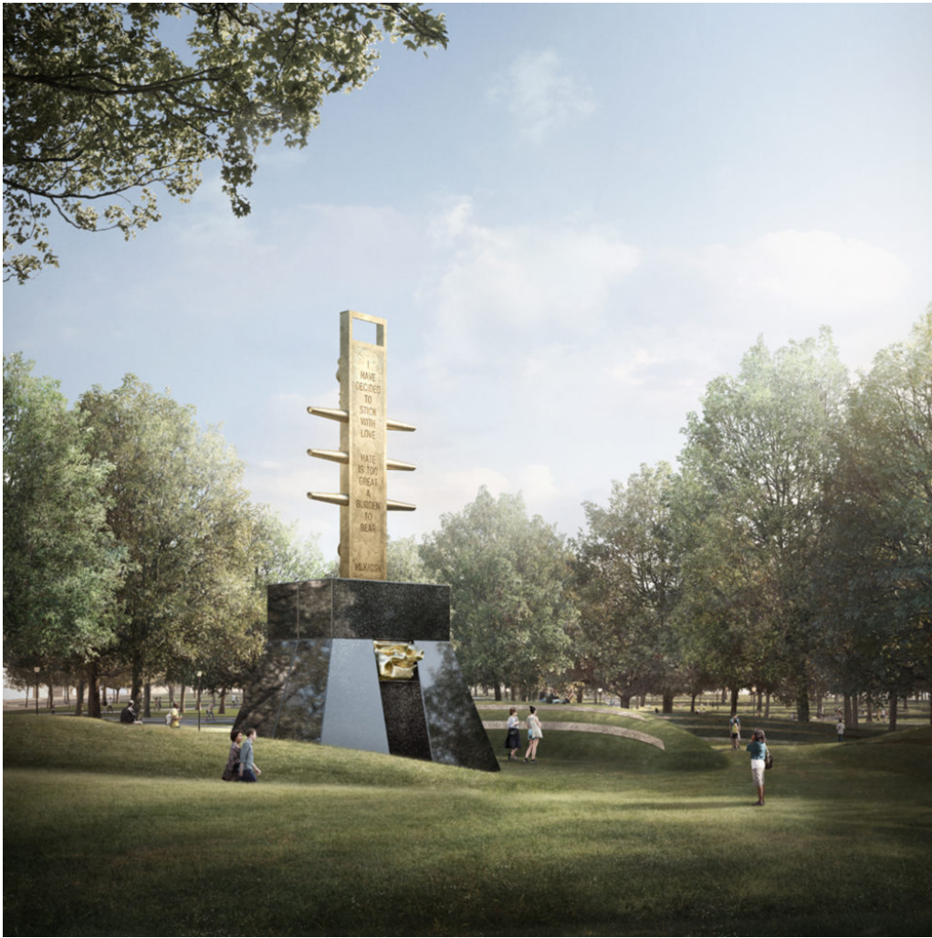
A rendering of Barbara Chase-Riboud's proposed memorial

Barbara Chase-Riboud is a well-known artist whose abstract sculptures have memorialized Malcolm X, Marian Anderson, Martin Luther King Jr. and many others. She has proposed a memorial made of light, stone and bronze. At the center is a truncated stone pyramid, which represents the Kings' mission for justice. "The searchlight beacon symbolizes their message from the top of the mountain they climbed together," according to Chase-Riboud's proposal.