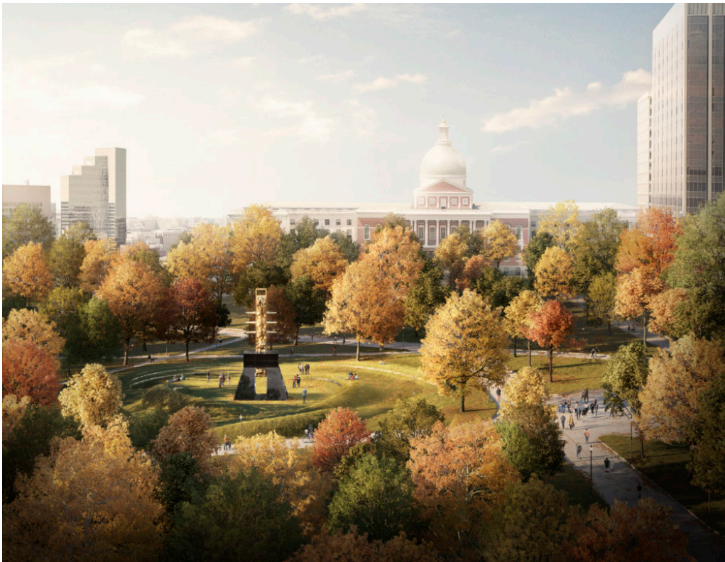
A rendering of Barbra Chase-Riboud's proposed memorial

Barbara Chase-Riboud with Michael Rosenfeld Gallery