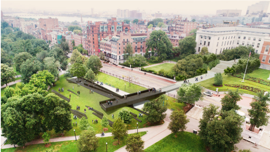
David Adjaye and Adam Pendleton with FuturePace's rendering of their proposed memorial

David Adjaye and Adam Pendleton with FuturePace