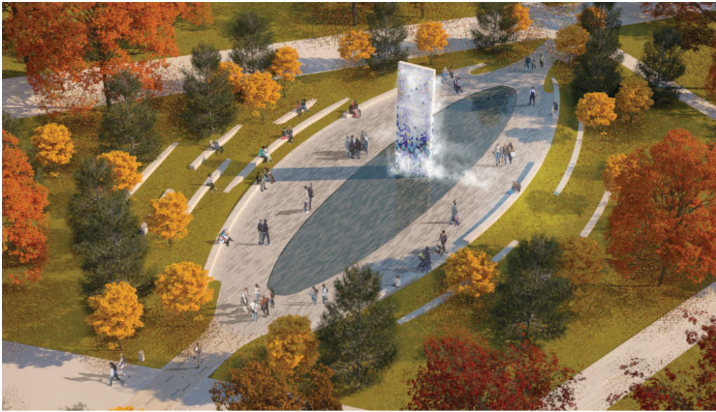
Yinka Shonibare's proposed memorial