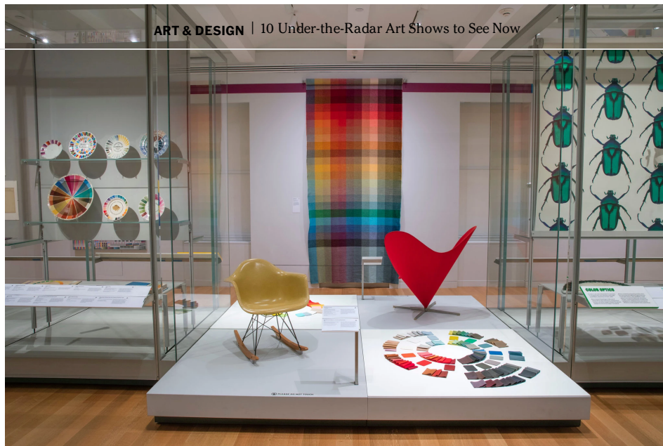
An installation view of “Saturated: The Allure and Science of Color,” a show of almost 200 pieces at the Cooper Hewitt, Smithsonian Design Museum.

This museum excels at exhibitions that brim with somewhat arcane information embodied by visually dazzling objects, and few subjects qualify for that approach like color. This show is all the more impressive because the nearly 200 items on view, which range through centuries, have been drawn almost entirely from the Cooper Hewitt’s vast holdings.