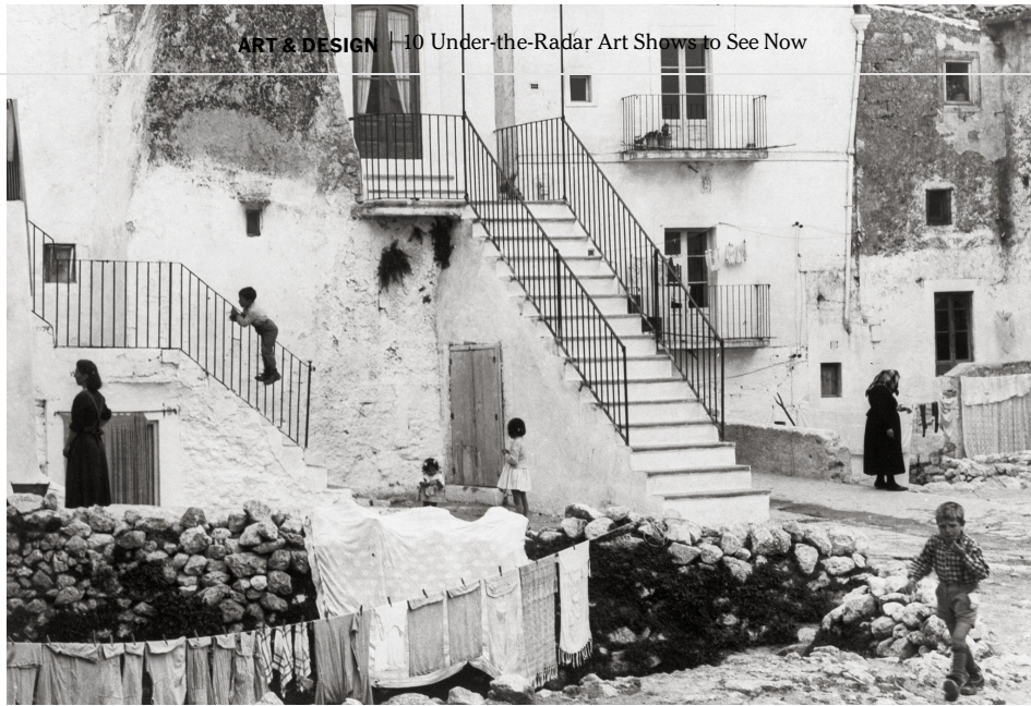
Many of these images vividly capture public life in Italy in the postwar years, like “Apulia Apulia,” taken by in 1958.