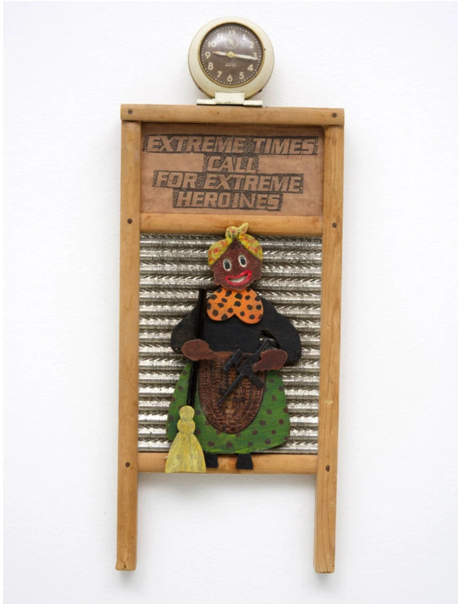
"Extreme Times Call for Extreme Heroines," one of the wry assemblages in the show "Betye Saar: Keepin' It Clean," at the New-York Historical Society.