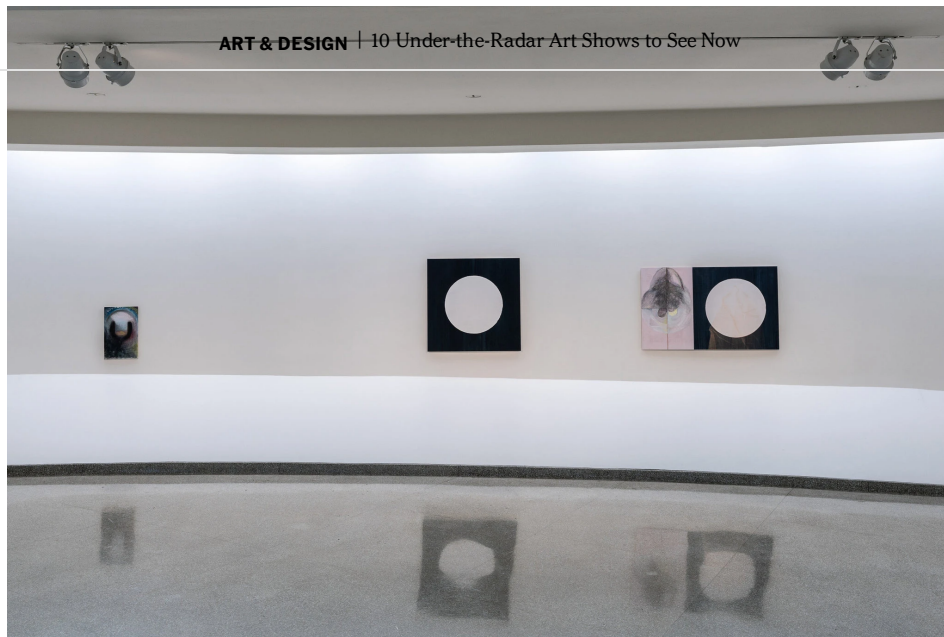
An installation view of the show in the Guggenheim's rotunda. The exhibition's works were created in response to the art of Hilma af Klint.