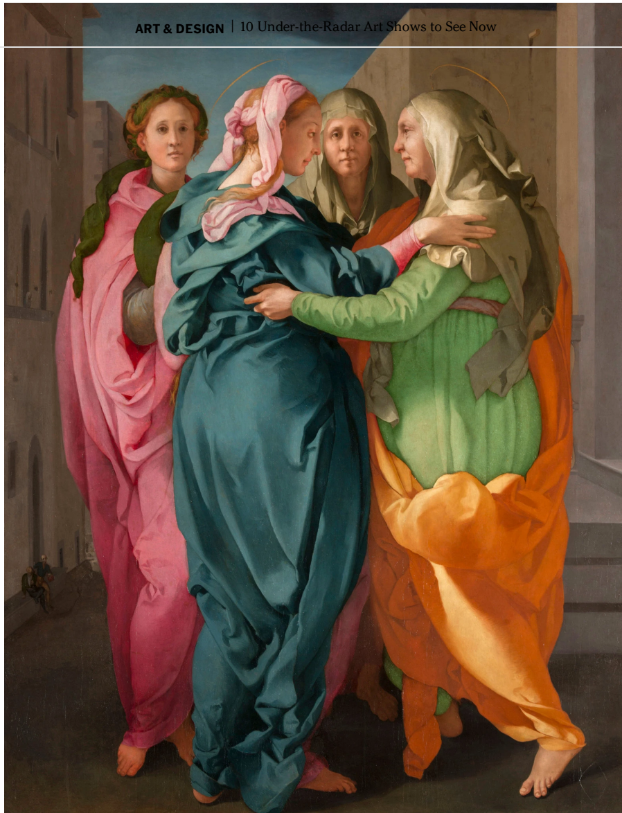
Jacopo da Pontormo's "Visitation" (1528-30), which shows the Virgin Mary greeting her aged cousin Elizabeth, is at the heart of "Pontormo: Miraculous Encounters," a show at the Morgan Library & Museum. Pieve dei Santi Michele e Francesco, Carmignano

The smallest of the fall's great museum exhibitions centers on a single Mannerist masterpiece: Jacopo da Pontormo's stunning "Visitation" (1528-30), which depicts the meeting of the Virgin Mary and her aged cousin Elizabeth. Both are pregnant (Elizabeth with John the Baptist); each is accompanied by a female attendant. It was executed for a noble family in Carmignano, Italy, where it hangs above the altarpiece in the parish church. The Morgan has installed the painting similarly, in the chapel-size Clare Eddy Thaw Gallery. I recommend sitting on the bench provided and gazing upward, as if from the first pew.