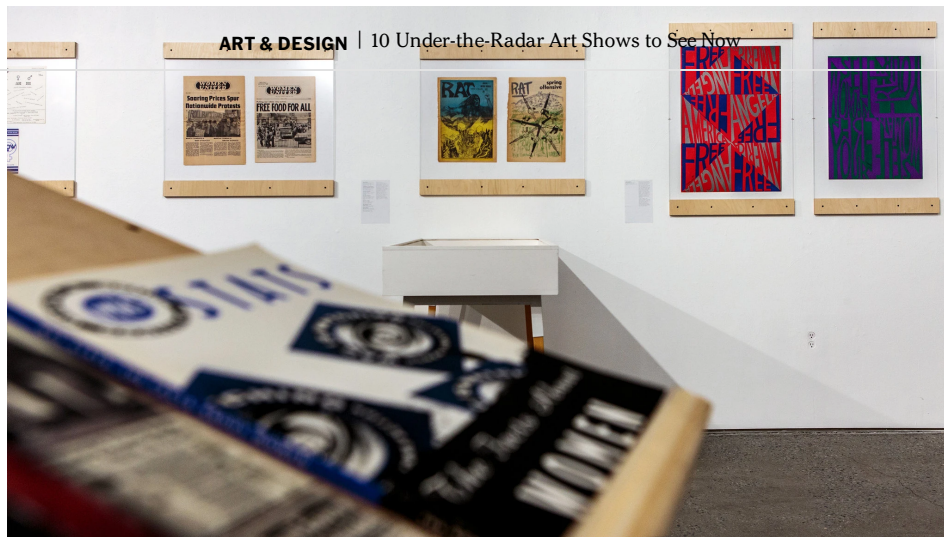
An installation view of “We Dissent ... Design of the Women’s Movement in New York,” at Cooper Union. It includes, at far right, two 1971 posters by Faith Ringgold: “America Free Angela,” left, and “Freedom Woman Now.”