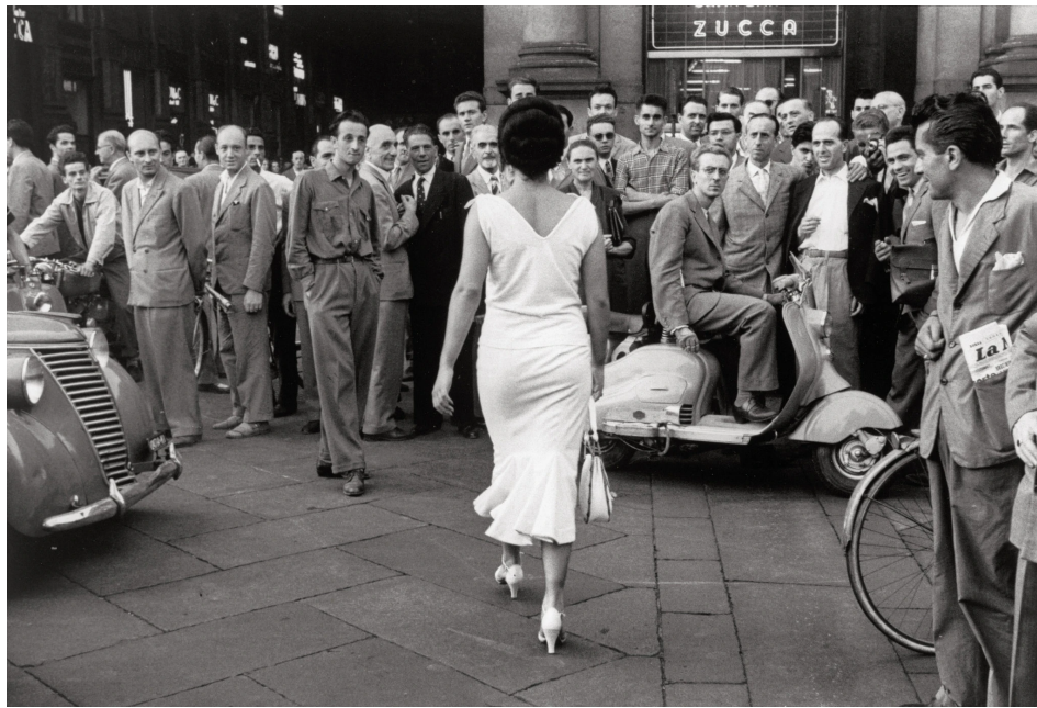
"The Italians Turn Around Milan," a 1954 photograph by Mario De Biasi, is among the works in "NeoRealismo," at the Grey Art Gallery.

The artworks most associated with Italian neorealism are heart-wrenching movies that dramatize the hardships of postwar life. This exhibition makes the case for an Italian neorealist photography movement that may not have produced masterpieces at the same rate, but was more wide-ranging and less stark than its filmic counterpart.