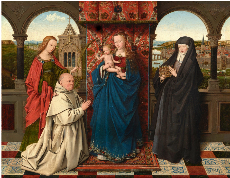
"Virgin and Child With St. Barbara, St. Elizabeth and Jan Vos," a painting by Jan van Eyck and his workshop, in the show "The Charterhouse of Bruges," at the Frick Collection.