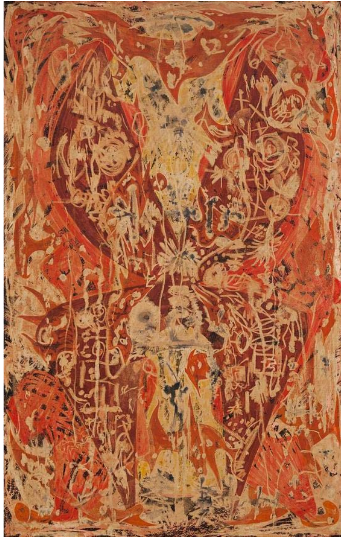
Alfonso Ossorio, #2, 1953, 1952-53; ink, wax and watercolor on paperboard, 60" x 38"; Courtesy of Michael Rosenfeld Gallery