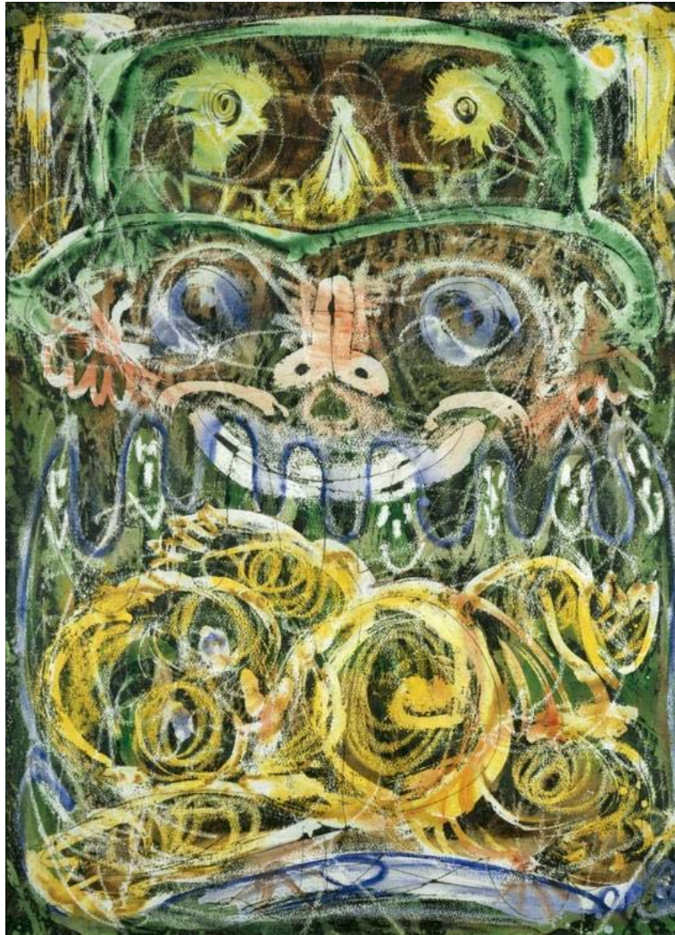
Alfonso Ossorio, Baby Collector, 1950; ink, wax and watercolor on Whatman board, 30" x 21 7/8", signed and dated; Courtesy of Michael Rosenfeld Gallery LLC, New York, NY

In many ways, Ossorio's style from this period seems to anticipate what we now call Neo-Expressionism. He is ab-ex with a definite emphasis on the "ex," reconciled with Dubuffet's embrace of "low art," and executed with great skill. Works like Baby Collector (1950) and Untitled (MR420) (1949) look like brilliant expressionist graffiti that wouldn't be at all out of place in a Basquiat exhibition.