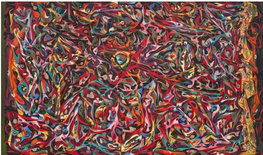
Alfonso Ossorio, Beach Comber, 1953; oil on canvas, 84 3/8" x 144 3/8", signed and dated; Courtesy of Michael Rosenfeld Gallery