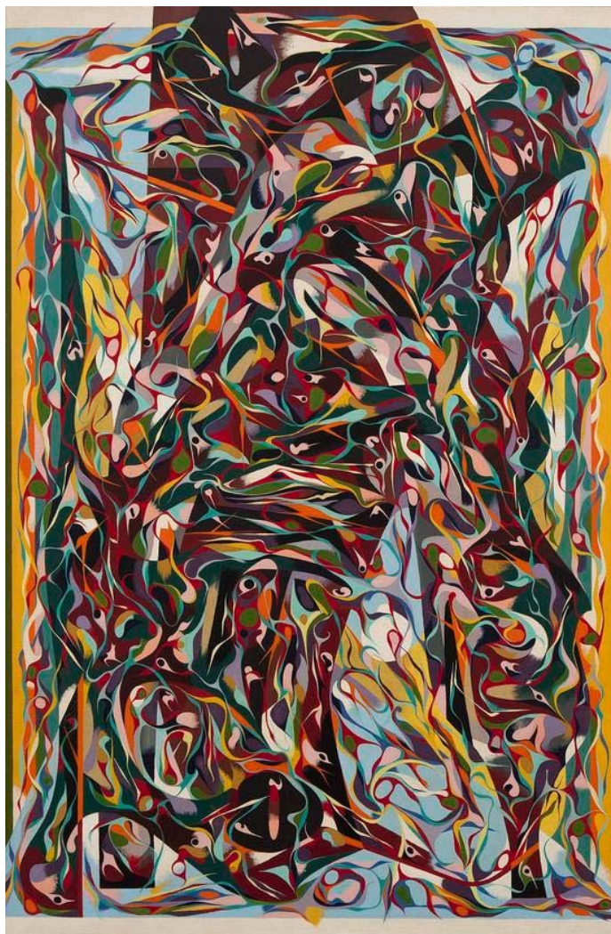
Alfonso Ossorio, Blood Lines, 1953-54; oil on canvas, 77" x 51 1/4", signed