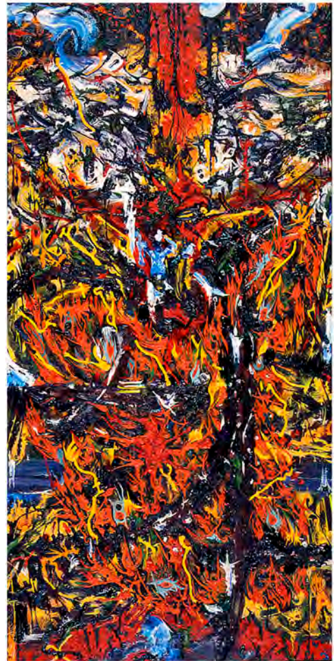
Act of Faith / Auto da Fé, 1956, oil on canvas, 76 7/8" x 38", signed

Internationally recognized for his complex and challenging visual language, Ossorio has been the subject of numerous exhibitions and publications. In 1992, the Whitney Museum of American Art presented Alfonso Ossorio, Drawings 1940-48: Anatomy of a Surrealist , and in 1997,