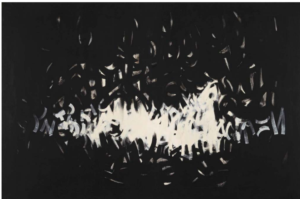
Norman Lewis, "Alabama," 1960. Oil on canvas, 48 x 72 1/4 inches

Like most of his artist-peers, Lewis, an alumni of the John Reed Club, was on the political left and his early paintings show it. “The Dispossessed” is social-realist in subject, an evicted family, but inflected with School-of-Paris color and light. “Untitled (Police Beating)” from 1943 depicts what it says—the cop is white and the victim is black. “Hep Cats” and “Meeting Place,” which represent Harlem life, recall the work of Lewis’ friend, Romare Bearden.