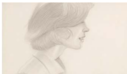
After the Fame Come the Masterpieces, Alex Katz at Richard Gray Gallery In "Drawings"