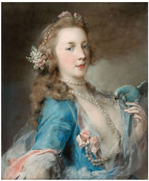
Rosalba Carriera, "A Young Lady with a Parrot" (1725–35), pastel on blue laid paper, mounted on laminated paper board, 600 x 500 mm