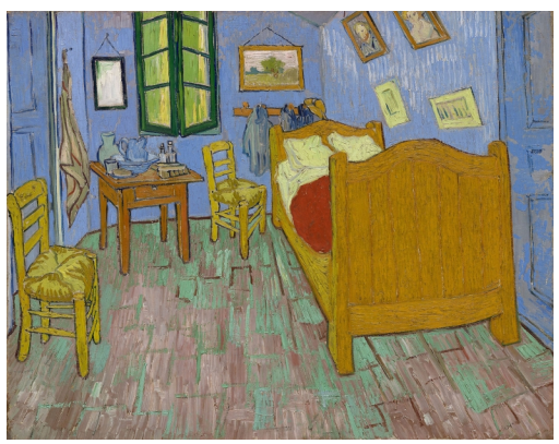
Vincent van Gogh, "The Bedroom" (1888), oil on canvas, 29 x 36 5/8 inches

This move is not unprecedented. According to Artnet News, the Metropolitan Museum of Art also made all of the public domain works in its collection available online back in February 2017. As a result, the Met's website saw a 64% increase in image downloads and a 17% traffic spike to the online collection. In addition, users who downloaded images spent five times as long on the site.