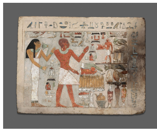
Ancient Egyptian, "Stela (Commemorative Stone) of Amenemhat and Hemet" (1956 BCE–1877 BCE), limestone and pigment, 12 1/4 × 16 3/8 × 2 5/8 inches