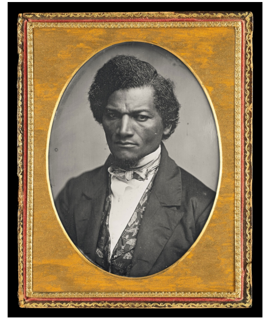
Samuel J. Miller, "Frederick Douglass" (1847–52), daguerreotype, plate: 5 1/2 × 4 1/8 inches, mat opening: 4 3/4 \times 3 1/2 inches, plate in closed case: 6 × 4 3/4 \times 1/2 inches, plate in open case: 6 × 9 1/2 \times 3/4 inches

This move is not unprecedented. According to Artnet News, the Metropolitan Museum of Art also made all of the public domain works in its collection available online back in February 2017. As a result, the Met's website saw a 64% increase in image downloads and a 17% traffic spike to the online collection. In addition, users who downloaded images spent five times as long on the site.