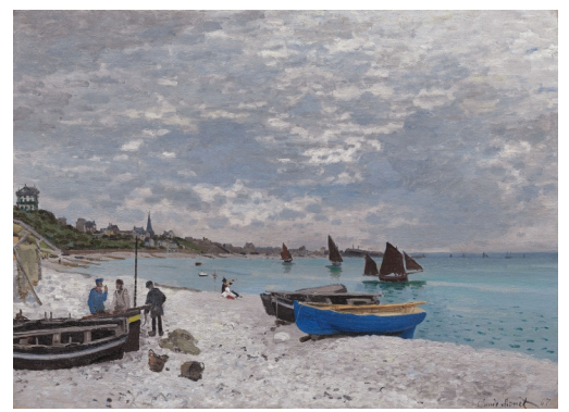
Claude Monet, "The Beach at Sainte-Adresse" (1867), oil on canvas, 29 13/16 x 40 5/16 inches