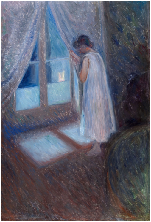
Edvard Munch, "The Girl by the Window" (1893), oil on canvas, 38 × 25 3/4 inches