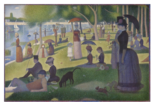
Georges Seurat," A Sunday on La Grande Jatte — 1884" (1884–8), oil on canvas, 81 3/4 x 121 1/4 inches

The Art Institute of Chicago has opened up much of its digital archive to the public. Now, website users have unrestricted access to thousands of images — exactly 44,313, with more to be added — under the <u>Creative</u> Commons Zero (CCO) license.