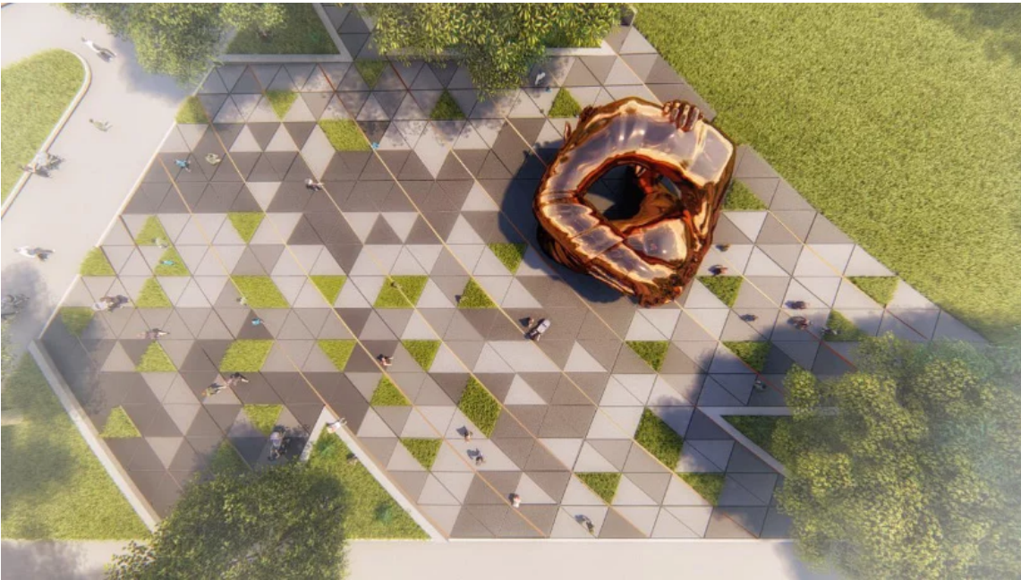
'the embrace' by hank willis thomas with MASS design group