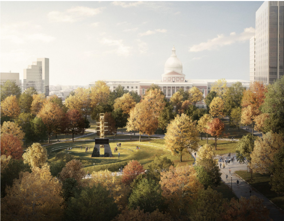
'empty pulpit monument' by barbara chase-riboud

artist barbara chase-riboud has devoted her career to sculptural embodiments of historical figures such as marian anderson, mao tse tung, and malcolm X. made of light, stone and bronze, her proposed memorial dedicated to martin luther king jr. and coretta scott king comprises a truncated stone pyramid, which represents their mission and