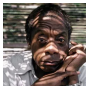
Schomburg Acquires James Baldwin