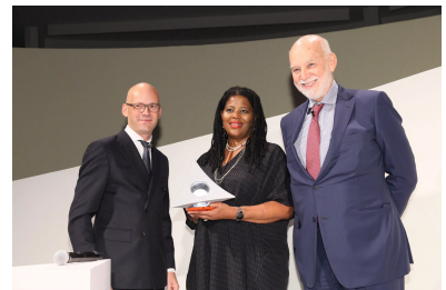
DAWOUD BEY'S PHOTOGRAPHIC TRIBUTE TO THE VICTIMS OF 16TH STREET BAPTIST CHURCH BOMBING COLLAPSES THE PAST AND PRESENT