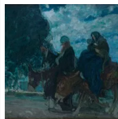
Auction Results: Painting is Alive and

Tags: Beauford Delaney, Christie's, Georgia O'Keeffe