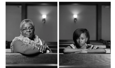
'SOUL OF A NATION' OPENS IN NEW YORK WHERE MANY OF THE EXHIBITION ARTISTS WERE ACTIVE DURING THE CIVIL RIGHTS, BLACK POWER ERAS