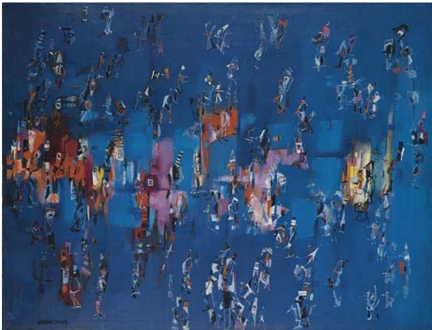
Lot 22 | NORMAN LEWIS, "Untitled," circa 1957 (oil on linen canvas). | Estimate $250,000-$250,000. Sold for Oct. 3, 2013 for $581,000.

Renewed interest in Lewis's practice was evidenced when the previous record for his work was set at Swann on Oct. 3, 2013. A bold blue composition, the untitled work sold for $480,000 ($581,000 including fees).