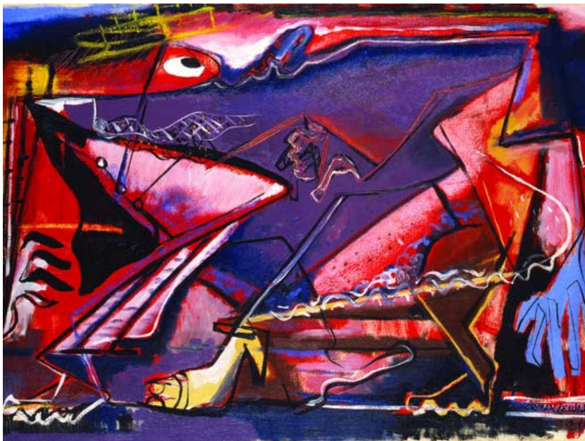
Norman Lewis' untitled work, known as 'Jazz Club,' was created in 1945 in oils and sand on canvas.

Given his extensive exhibition record of seven solo and 132 group shows, positive reviews by leading New York art critics and numerous prestigious awards, it is hard to fathom why Lewis has been so surprisingly overlooked. He remains an unfamiliar name to most museumgoers.