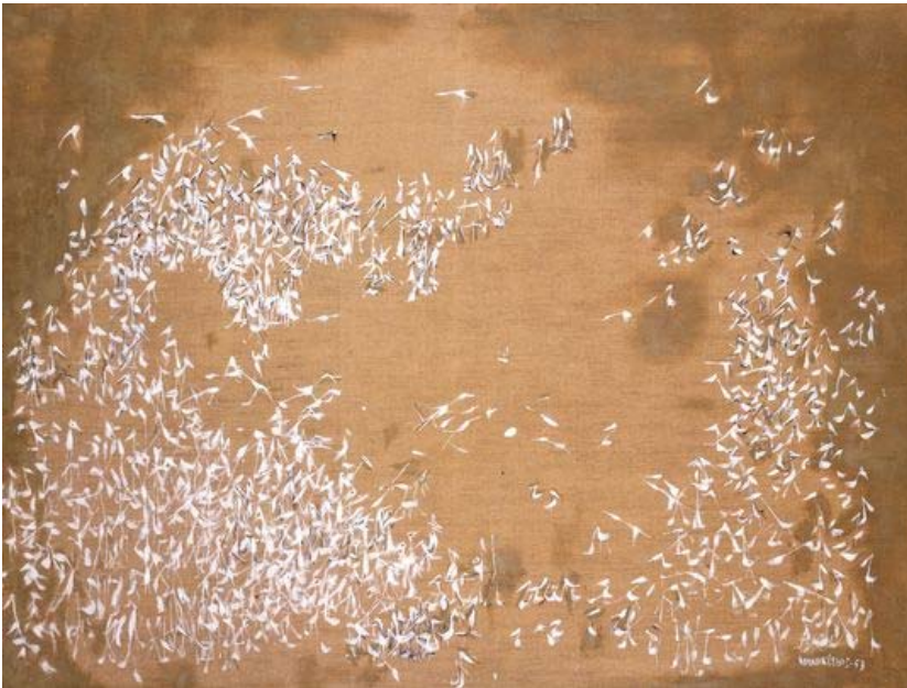
'Migrating Birds,' 1953 is an oil on canvas work by Norman Lewis.

paper or fabric on which he is painting.