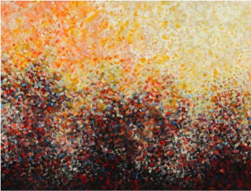
This untitled Norman Lewis work, called 'Barker and Crowd aka Torch' was created circa 1960. It is an oil on canvas work.

Interestingly, "Migrating Birds" dates from 1953 and was seen two years later at the Carnegie International, a prestigious contemporary art exhibit in Pittsburgh. By ballot, visitors chose the canvas as the most popular work on view, and Lewis was given an award of $200 for his Asian-looking curvilinear design of white-abstracted birds. Though the artist enjoyed the outdoors as an avid fisherman, it is possible that the subject of birds and their migratory flight may metaphorically suggest the movement of African-Americans from the South to the North, which considerably increased New York's black population after the Depression.