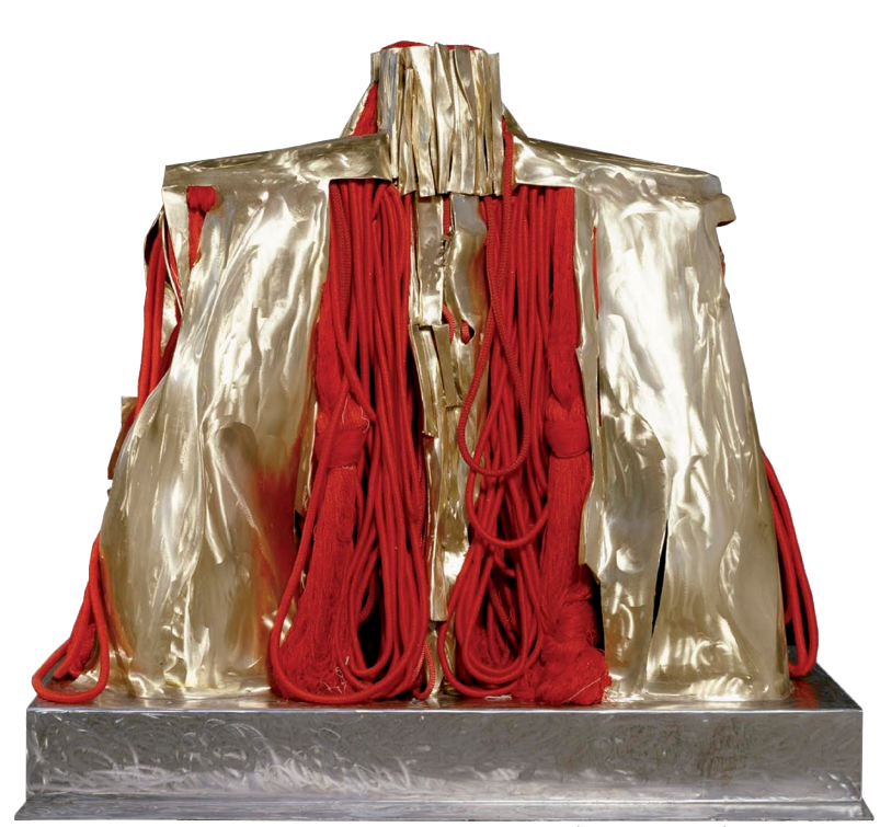
Mao's Organ, 2007, polished bronze and red silk cord, 78 3/4" x 59" x 29 1/2"