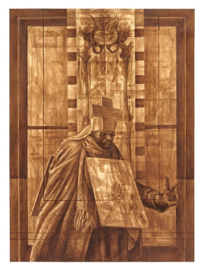
Charles White. Black Pope (Sandwich Board Man). 1973. Oil wash on board. 60 × 43 7/8" (152.4 × 111.4 cm) The Museum of Modern Art, New York. Richard S. Zeisler Bequest (by exchange), The Friends of Education of The Museum of Modern Art, Committee on Drawings Fund, Dian Woodner, and Agnes Gund. © 1973 The Charles White Archives.