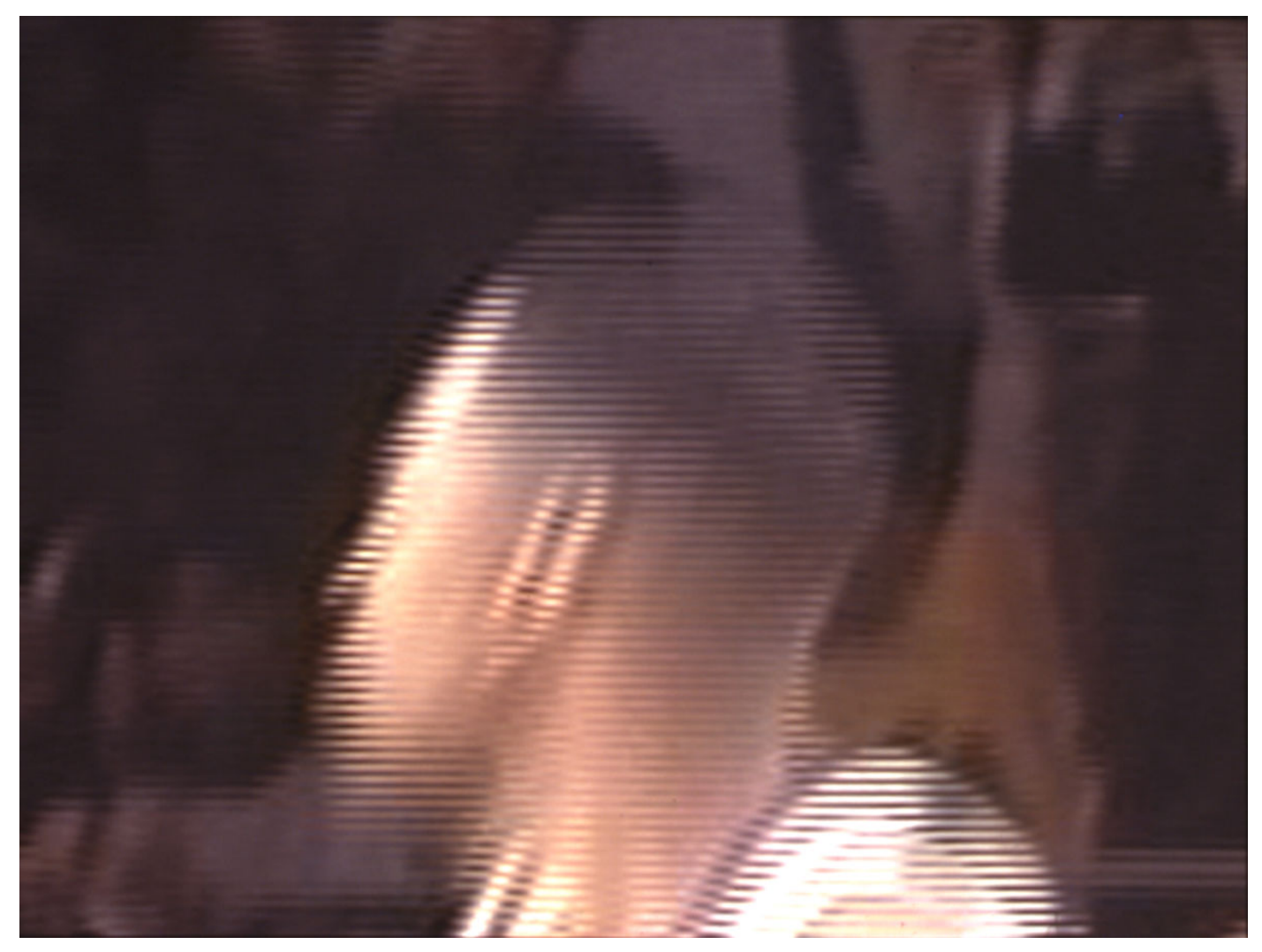
Paul Pfeiffer (b. 1966), Goethe's Message to the New Negroes, 2001. Video, color, silent; 0:39 min. looped; with color LCD monitor, metal armature, DVD player, and DVD, 5 1/2 × 6 1/2 × 36 in. (14 × 16.5 × 91.4 cm). Whitney Museum of American Art, New York; purchase with funds from the Contemporary Painting and Sculpture Committee 2001.227.

"Everything Is Connected: Art and Conspiracy" at The Met Breuer