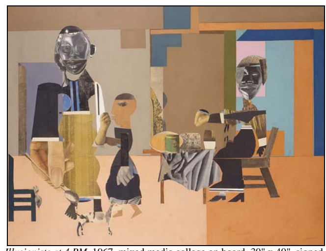
Illusionists at 4 PM, 1967, mixed media collage on board, 30" x 40", signed

The works at Rosenfeld were made from 1964 to 1983. Some are not much larger than sheets of typing paper; others are more than four feet on a side. Their suavely discordant compositions involve both black-and-white and color photographs and occasional bits of printed fabric; almost all depict some scene of black life, past or present or imagined.