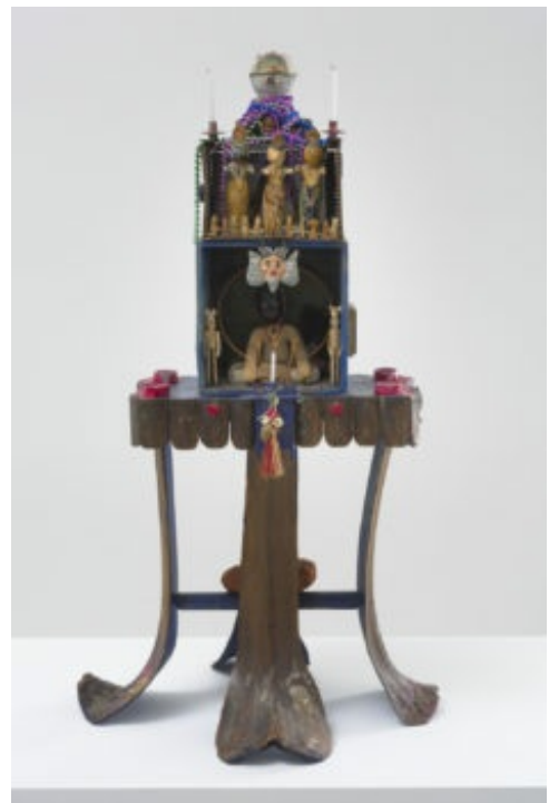
Betye Saar, Mti , 1973.