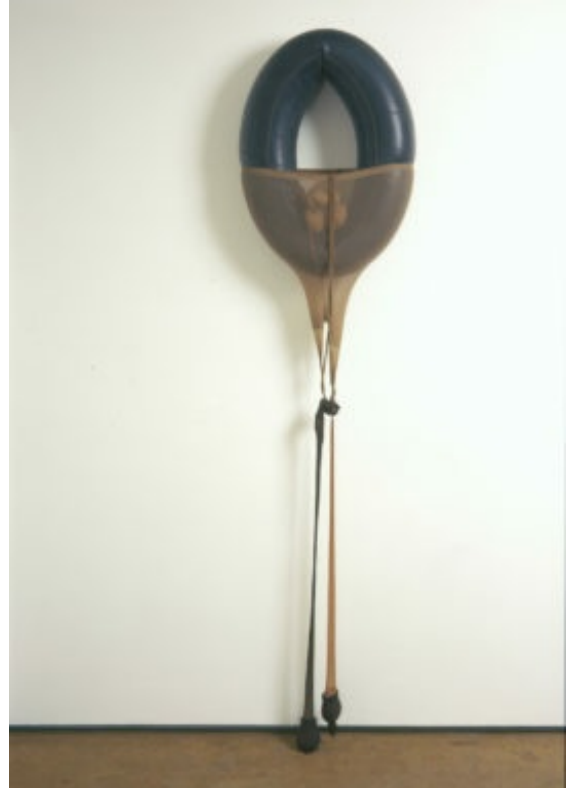
Senga Nengudi, R.S.V.P. XI , 1977/2004.

What role do shows like "Soul of a Nation" play for you?