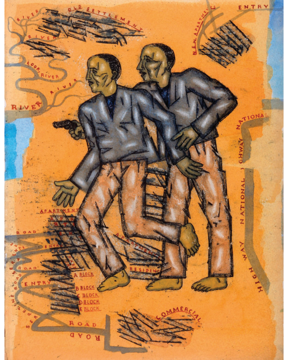
Arpita Singh, Boys, 2012, watercolor on paper, 14%" x 11". DC Moore.

In all but a few pieces, Kushner stripped down his palette to something stark. Gone are the warm harmonies of golds with greens and blues, or reds with oranges and clarets. Instead, Kushner offered canvases with a cacophony of blacks, whites, silvers, and mottled grays, punctuated by the occasional dark green