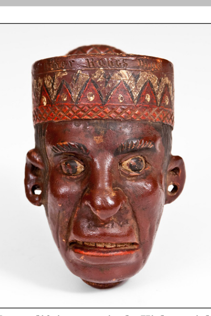
Exemplifying typical Kirkpatrick whimsy, this "made to order relic" Anna Pottery Indian head stoneware peace pipe, dated 1873, garnered $12,650.