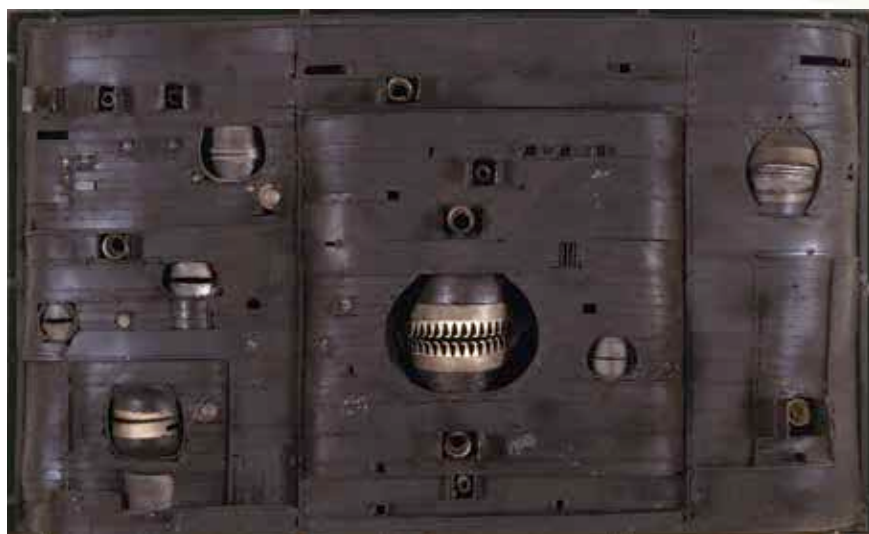
Lee Bontecou (b. 1931), Untitled, 1963. Welded steel and paint, 21½ x 31¼ x 6½ in., signed and dated.