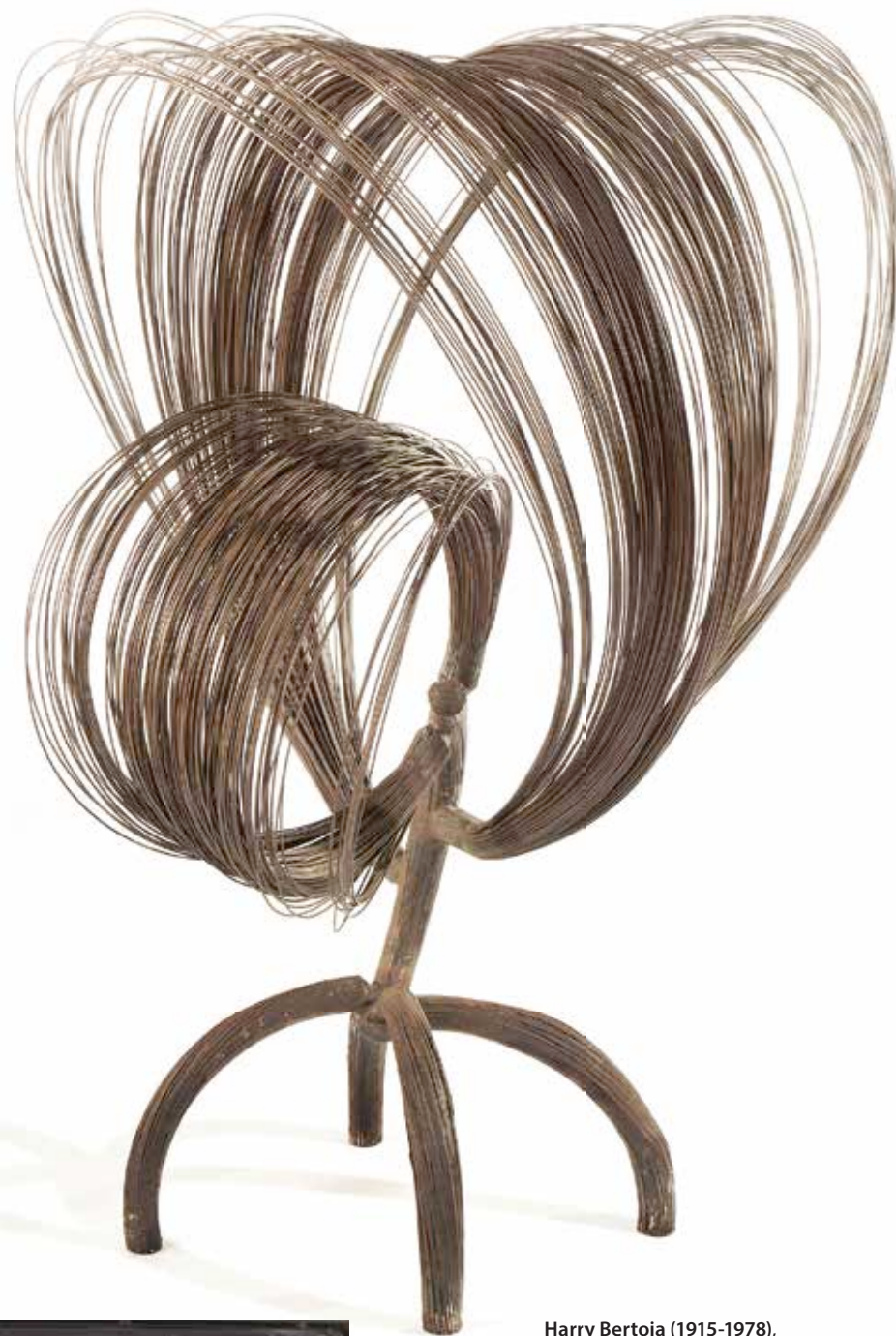
Harry Bertoia (1915-1978), Untitled, ca. 1955. Welded bronze, 35½ x 23½ x 23 in.

The metal survey will be on display through January 9, 2016. ■